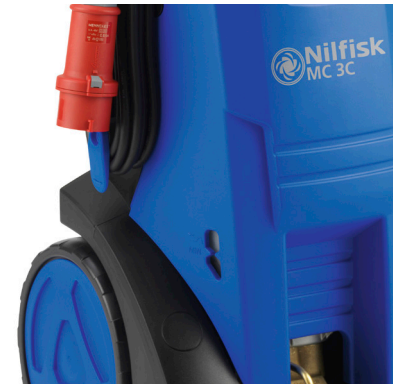
The turnable cable hook makes winding and unwinding of the electrical cable child's play.