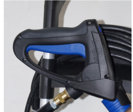
Unique patented Spray Gun Holder protects the gun from falling on the ground and being dragged behind the machine – preventing damage.

Designed for low intensity cleaning applications, the MC 4M is the powerful choice for small and medium agricultural sites, building companies, garages and car rental companies. Also, well suited to meet the needs of public authorities, small cleaning companies due to the limited sound level of the motor pump.