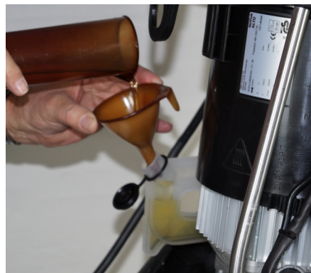
Pump oil tank with oil level sight and fill/empty function.

Some machines in the MC 3C range include this FoamSprayer technology, which allows a simple and efficient application of detergent. If not included it can be bought as an optional accessory.