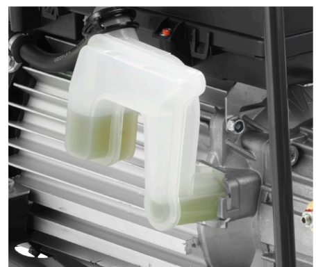
Pump oil tank with oil level sight and fill/empty function.