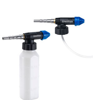
The FoamSprayer technology allows a simple and efficient application of detergent.