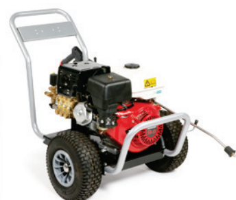
BENZ-C H2013Pi P