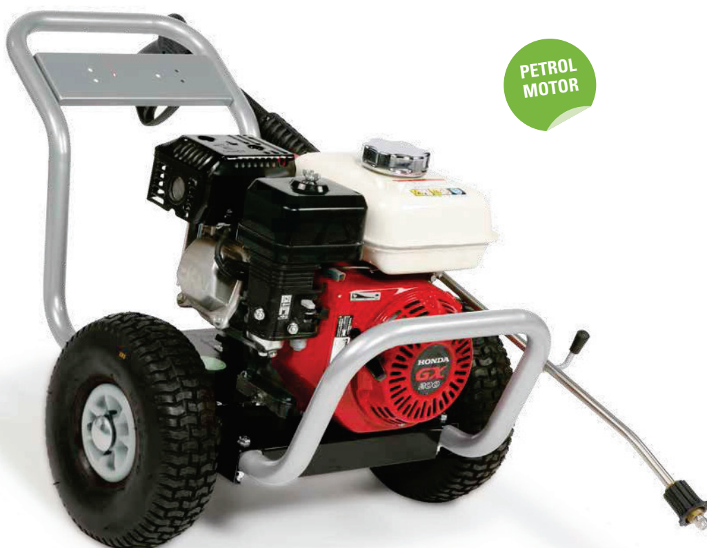
BENZ-C H1811Pi P