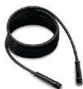
Flexible hose 10 m Code TBAP 25324