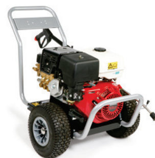
BENZ-C L2021Pi P